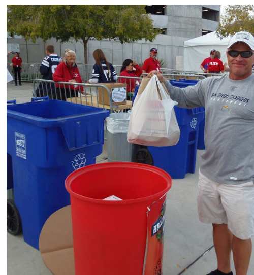
A Chargers fan donates food at last year's food drive