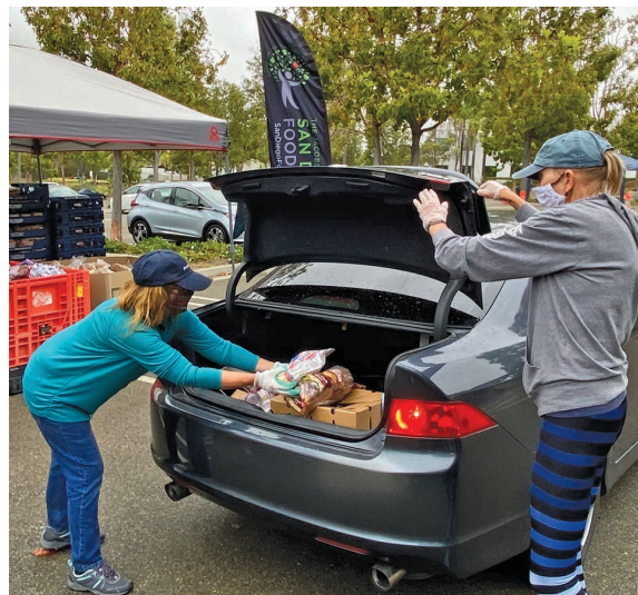
Volunteers place food in car trunks at the Food Bank’s daily “drive-thru” food distribution in Vista.

For information on donating to our COVID-19 Response Fund, please contact, Nancy Eisenberg at NEisenberg@SanDiegoFoodBank.org or 858-863-5129.