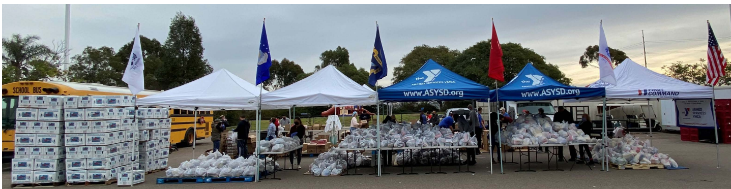
The Armed Services YMCA's monthly drive-thru food distribution in partnership with the San Diego Food Bank provides food assistance to hundreds of low-income military families every month.