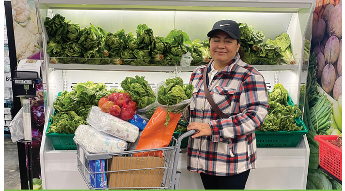
A Food Bank client receives food assistance at the Food Bank's new Client Choice Food Pantry.